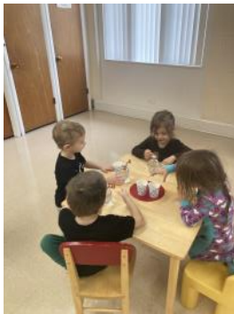
Breaking Bread together!

Pictures from our Parents' Morning Out fun and togetherness on December 27th, 2024!