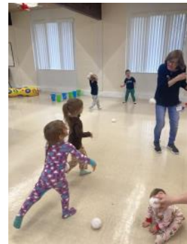
A Snowball fight!

As you can see, we remain busy and happily playing during our nursery events!